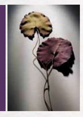
Unlawful sexual relationships lead to many psychological diseases and disorders.

In relation to this, there is a grave punishment for fornication in Islam. It is described as an animalistic relapse, which effaces all these meanings, and goals [mentioned above] and transforms a human into an animal. He would not differentiate between one woman and another, nor would a woman differentiate between one man and another. All a person hopes for is to fulfill his sexual desire. Even if he does differentiate between one and another, no goodness would result from this relation, and he may not be trusted or charged with the betterment of his (nation); no offspring or true emotions would result. True emotions have a lasting effect. This is the difference between lusts, passions and true emotions. Many do not differentiate between these things, and are confused in this regard. What many consider emotion is actually an animalistic passion! Islam does not bar one from expressing his natural emotions, nor regard them as lowly behavior. Islam only regulates, purifies and elevates it from animalistic lusts. Fornication, and promiscuity in particular, holds no such values, and is very distant from all feelings, emotions and ethical manners and sense of belonging and relationship. Islam regards promiscuity as the filthiest act in a human society. This practice would degrade man and equate him with an animal. In fact, there are many animals that live a decent and organized social life, far from the problems that arise from idolatry in some societies.